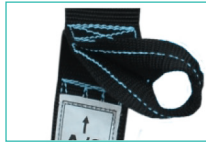
2 Chest attachment Textile Loops