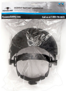
hang tag polybag